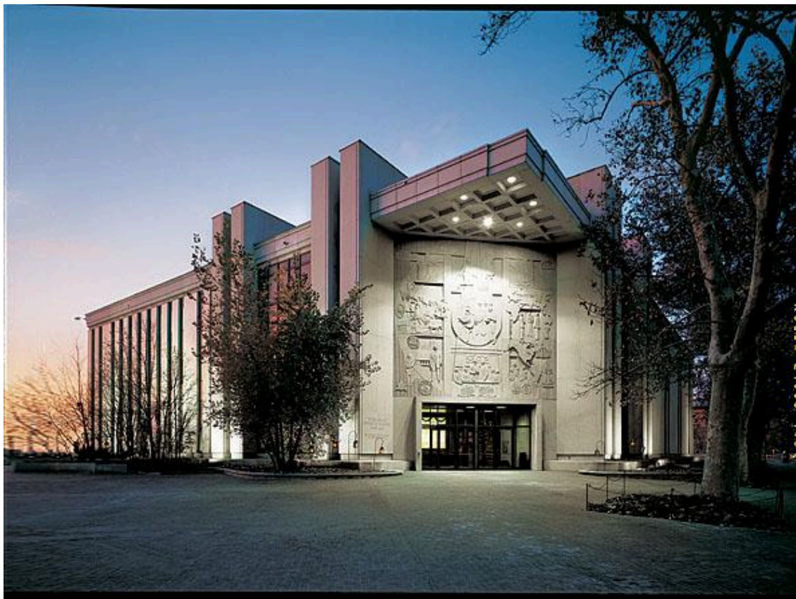
The Church History Museum in downtown Salt Lake City, 2010.

Work & Wonder invites audiences of all kinds to learn more about the legacy of cultural output from the Latter-day Saint tradition. Information for visitors of the show in downtown Salt Lake City is forthcoming.